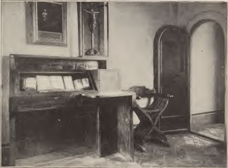
SAVONAROLA'S CELL IN THE CONVENT OF SAN MARCO.

Amid much that was most seductive in art, brilliant in literature, and captivating in social life, in Florence, and indeed throughout Italy and the world, in Savonarola's day, there was seething a mighty mass of corruption and an insidious skepticism sapping the foundation of all healthy belief, a vice so splendid and fascinating as to bring beneath its thralldom much that was virile, pure, and strong. Life was one long May-day dance; music and song lent their enchantments to the scene, and the brilliant present was so full and apparently so real that the spiritual seemed but the far-away echo of a beautiful but baseless dream. Upon such a scene as this the keen, clear eye of the impassioned young Dominican lookt out, often with fiery glance and clouded brow, and oftener still through the soft mist of tears. His words were strong and trenchant, now a Cassandra cry and now with long vibrations in them, and tears, too, while ever and anon, gathering up his strength, his soul aglow with righteous indignation, he hurled into the midst of all this deep mystery of wickedness his loudest anathemas and prophecies of doom. To so earnest a soul as his it seemed but too often a forlorn hope. Around him a people steeped in skepticism and uncleanness, with the altar-fires of home all quenched, with the pure links of social ties all broken, honor a name, and virtue but a text for brilliant epigram or lewd lampoon, while darker and more